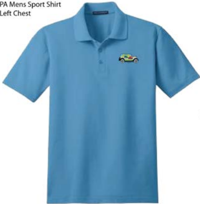
PA Mens Sport Shirt Left Chest

PORT AUTHORITY Stain-Resistant Men's Polo K510 & TLK510 60/40 cotton/poly with open hem and side vents