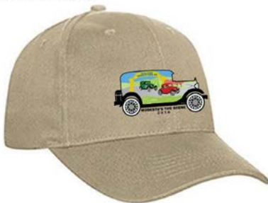
Khaki Hat Location: Front Panel

Khaki Hat with matching adjustable Velcro hook & loop closure.