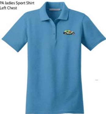
PA Ladies Sport Shirt Left Chest

PORT AUTHORITY Stain-Resistant Ladies Polo K510 60/40 cotton/poly with open hem and side vents